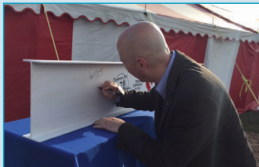
Governor Pete Ricketts